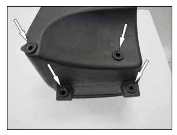
7. Remove the four mounting grommets from the factory air filter housing and install them into the K&N® housing as shown.