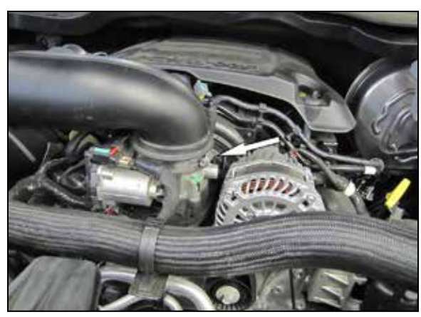
3. Loosen the hose clamp that secures the factory intake tube to the throttle body and then disconnect the intake tube from the throttle body.