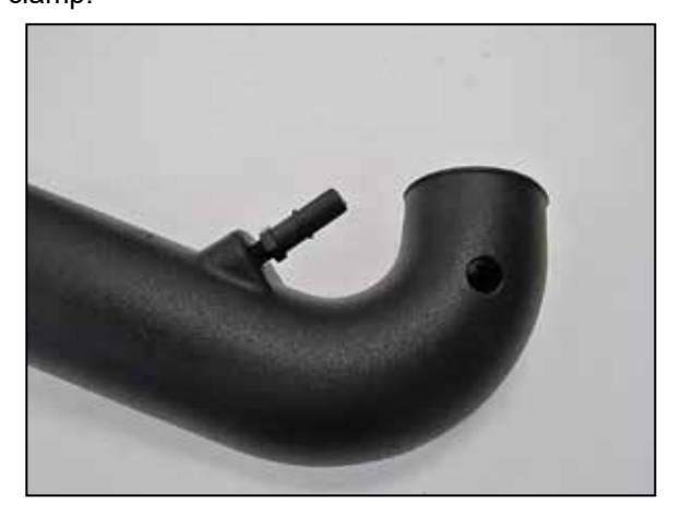
11. Install the provided NPT quick disconnect fitting into the K&N® intake tube as shown.

NOTE: Plastic NPT fittings are easy to cross thread. Install the vent fitting "hand" tight, then turn it two complete turns with a wrench.