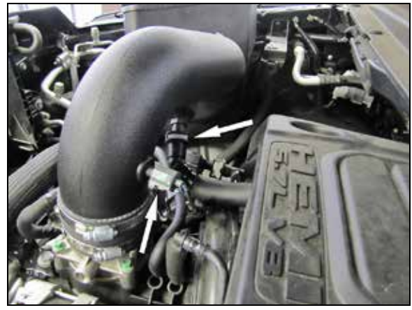
15. Reconnect the inlet air temperature electrical connection. Connect the factory crank case vent line to the quick disconnect fitting installed into the K&N® intake tube.