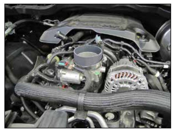
9. Install the provided coupler (08698) onto the throttle body and secure with the provided hose clamp.