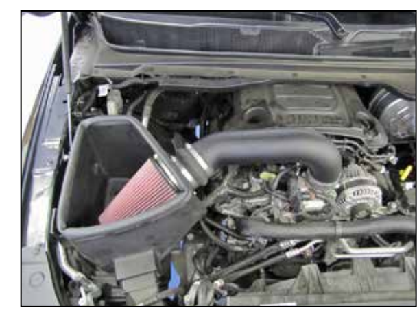
17. Reconnect the vehicle's negative battery cable. Double check to make sure everything is tight and properly positioned before starting the vehicle.

18. It will be necessary for all K&N® high flow intake systems to be checked periodically for realignment, clearance and tightening of all connections. Failure to follow the above instructions or proper maintenance may void warranty.