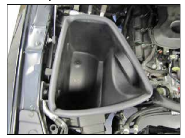
8. Install the K&N® air filter housing into the vehicle so the grommets fit onto the factory mounting posts.