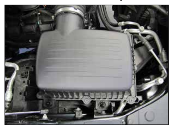
4. Pull up the factory air filter housing to dislodge it from the mounting grommets and then remove the complete intake assembly from the vehicle.

NOTE: K&N Engineering, Inc., recommends that customers do not discard factory air intake.