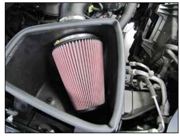
16. Install the K&N® air filter onto the filter adapter and secure with the provided hose clamp.