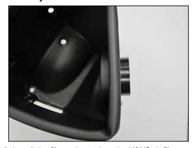
6. Install the filter adapter into the K&N® air filter housing and secure with the provided hardware.

NOTE: Some trimming of the edge trim will be necessary.