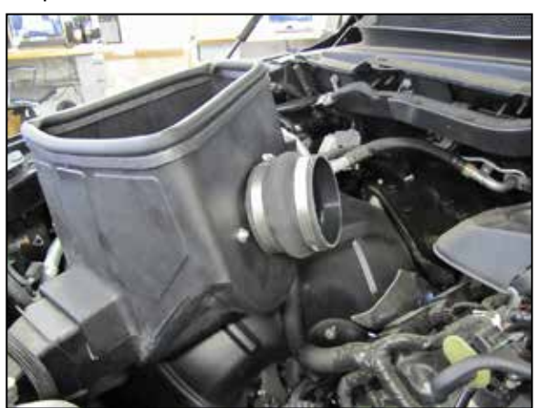
10. Install the provided hump coupler (08418) onto the filter adapter and secure with the provided hose