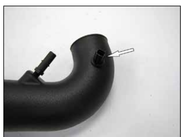
13. Install the sensor into the K&N® intake tube using the provided grommet.