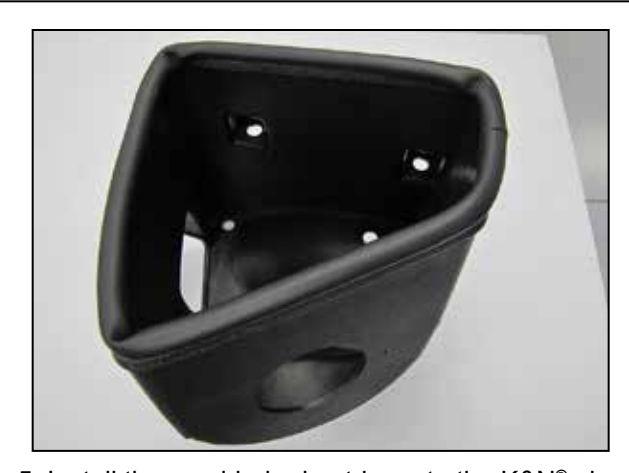
5. Install the provided edge trim onto the K&N® air filter housing as shown.

NOTE: K&N Engineering, Inc., recommends that customers do not discard factory air intake.