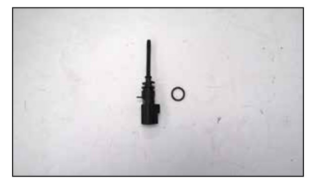
12. Remove the inlet air temperature sensor from the factory intake tube and then remove the O-ring from the sensor.

NOTE: Plastic NPT fittings are easy to cross thread. Install the vent fitting "hand" tight, then turn it two complete turns with a wrench.