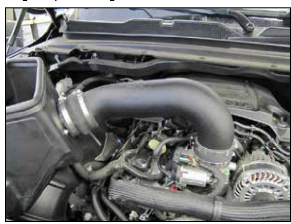
14. Install the K&N® intake tube into the hump coupler at the filter adapter and then into the coupler at the throttle body, adjust the tube for best fit and then secure with the provided hose clamps.